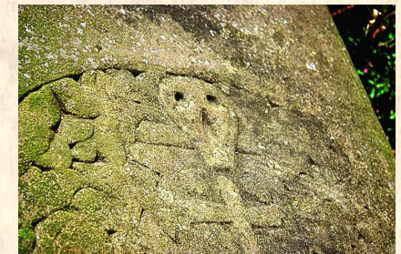
'Witch's Grave' at Newchurch