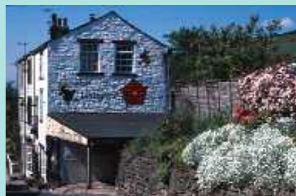
'Witches Galore', Newchurch

St Mary's Church gave the village its name, although the parish is still called Goldshaw Booth as it was 600 years ago. On the church tower is a stone known as the "Eye of God", which is said to observe those going to worship. The so-called witch's grave is of the wrong date, but the Devices admitted taking teeth from skulls in the churchyard. The body of the church dates from the 18th century, but it was first consecrated in 1544.